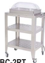
WBC-2RT 2 Pans & 1 Rolltop Lid

Rolltop Lids Models: WBC-5RT, WBC-4RT, WBC-3RT, WBC-2RT Clear Individual Lids Models: WBC-5SP, WBC-4SP, WBC-4SLP, WBC-3SLP, WBC-3SP, WBC-2SP